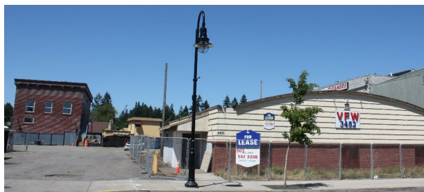
A view of the old and the new VFW.